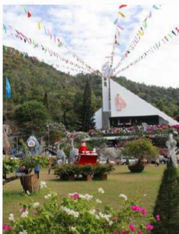
Bai Dau Church