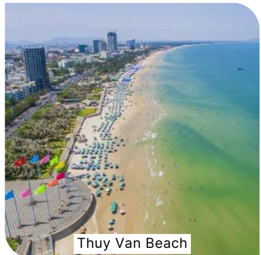
Thuy Van Beach