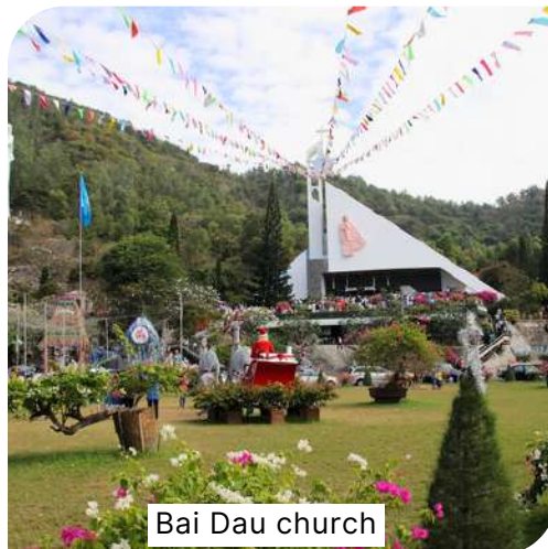
Bai Dau church