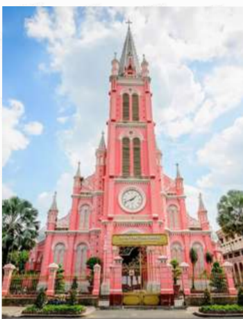
Tan Dinh Church