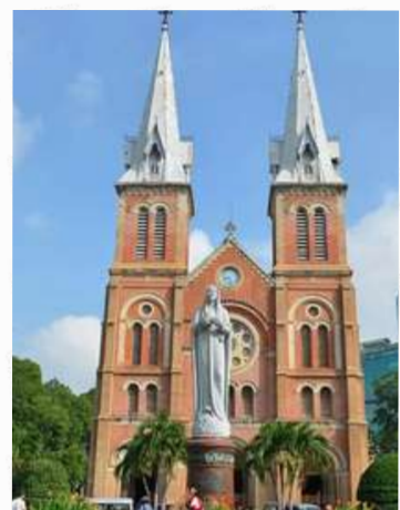
Notre Dame Cathedral